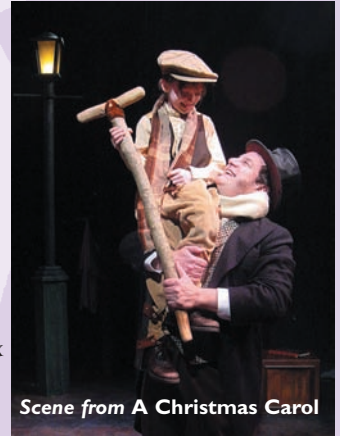
Scene from A Christmas Carol

Many cast members remain from the beginning, while others have logged in a dozen years or more. The fresh faces of interns come and go, but to know BTE is to love it, and many visiting actors return to share the experience again. Those of us who don't act find ourselves drawn to the place as volunteers. This last year