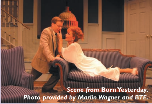
Scene from Born Yesterday .