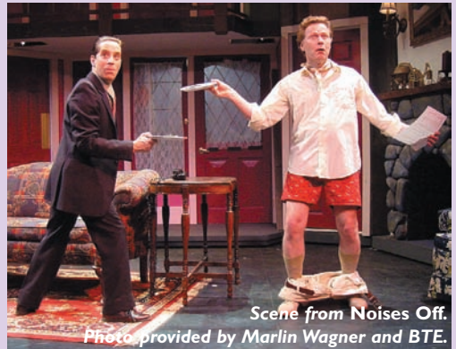
Scene from Noises Off .

I volunteered and then was hired as the box office manager. BTE is a vital force in the Bloomsburg area and I'm happy to be a part of that now. Check us out – but don't be surprised if you get pulled in by the 'force' too!